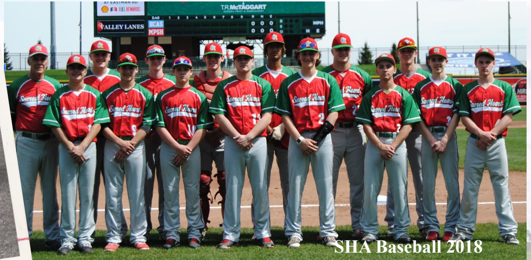
SHA Baseball 2018

Former Sacred Heart baseball players, parents of athletes, and friends of the baseball program are asked to help the SHA Athletic Association make improvements to the SHA Baseball Field on Lincoln Road in Mt. Pleasant.