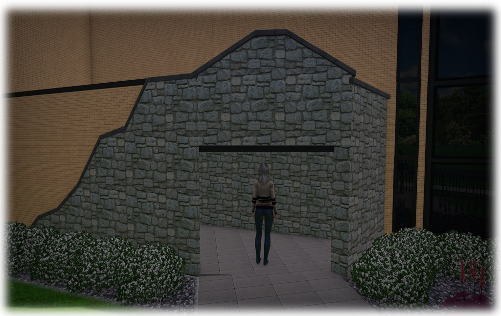
Entrance view of Grotto

As part of this campaign, an outside prayer grotto will be constructed on the church grounds which can be used by students, parishioners, and the community. This outdoor prayer space provides another place to welcome those to pray, encouraging them to evangelize to others who are not part of our parish and school community.